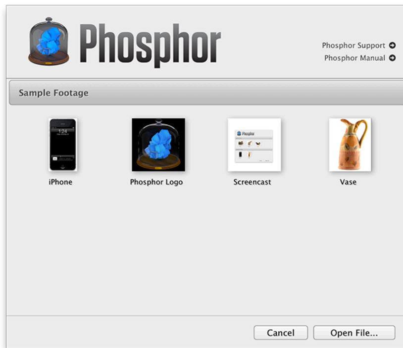
Figure. 2.1: Phosphor File Browser

Upon launch, Phosphor displays a grid of previously accessed media, as well as an assortment of sample source material. If you're still in the process of getting familiar with Phosphor, the sample media gives you the opportunity to begin experimenting immediately. You can use the "open" button (or select open from the file menu) to open any other modern QuickTime movie on your computer.